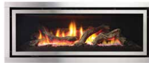
Door frame and fascia in brushed stainless steel