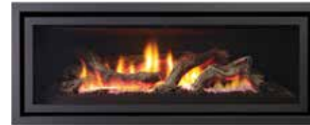
Door frame and 22mm finishing trim in black