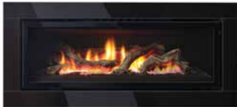
Glass fascia in black with black inner door frame