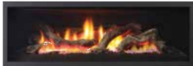
Clean edge finish (no fascia)