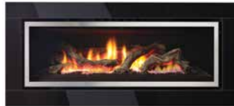
Glass fascia in black with brushed stainless steel inner door frame