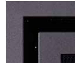
Clean Front with 22mm Finishing Trim