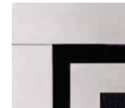
Brushed Stainless Steel Fascia