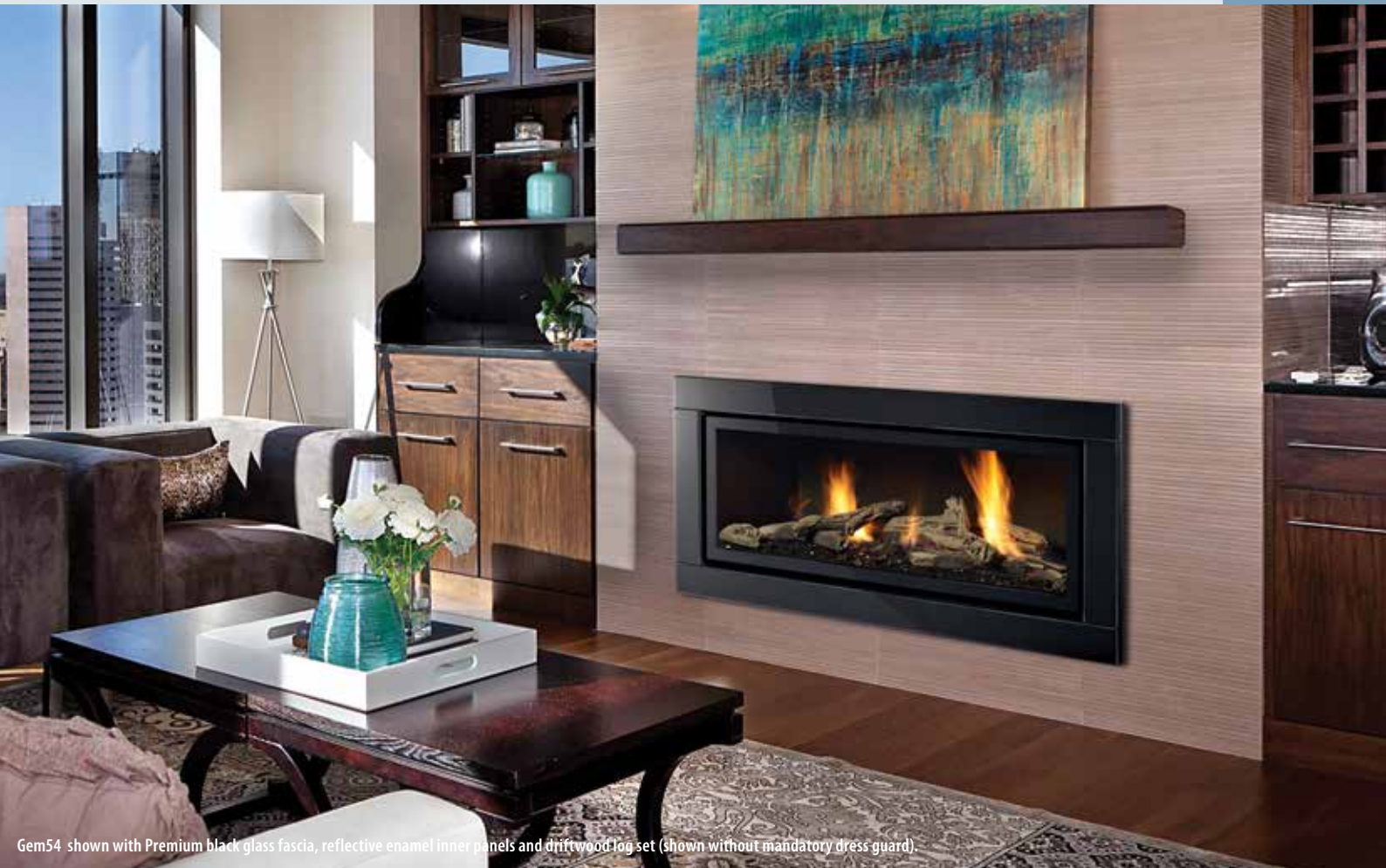
Gem54 shown with Premium black glass fascia, reflective enamel inner panels and driftwood log set (shown without mandatory dress guard).