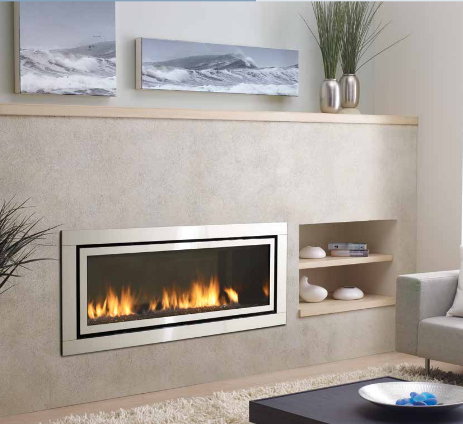
Above: Gem54 shown with stainless steel fascia, reflective inner panels and crystals (shown without mandatory dress guard).