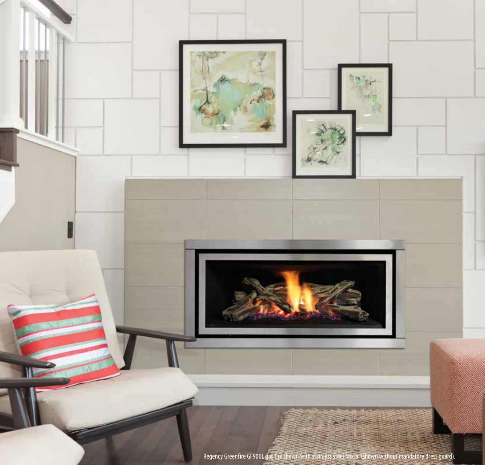
Regency Greenfire GF900L gas fire shown with stainless steel fascia (shown without mandatory dress guard).