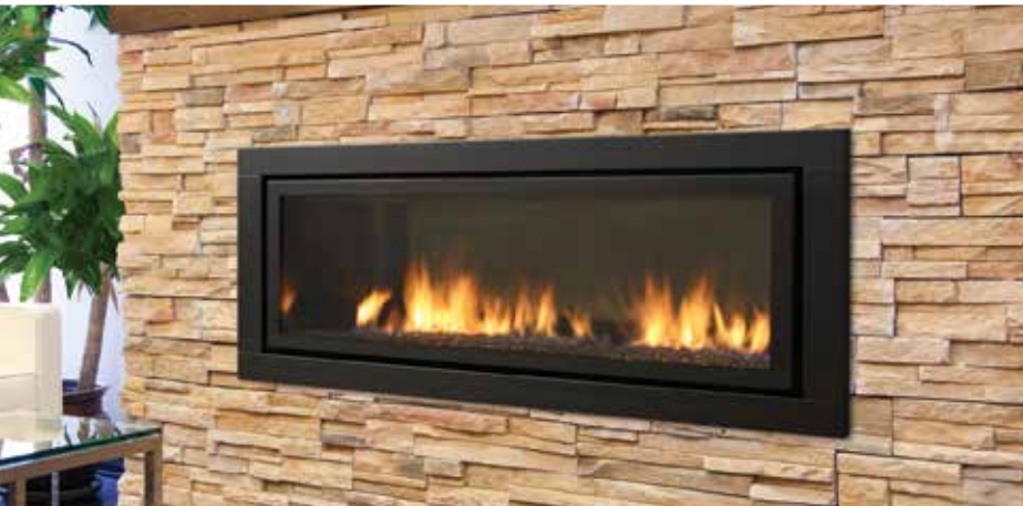
Gem54 shown with black fascia, reflective inner panels and pebbles (shown without mandatory dress guard).