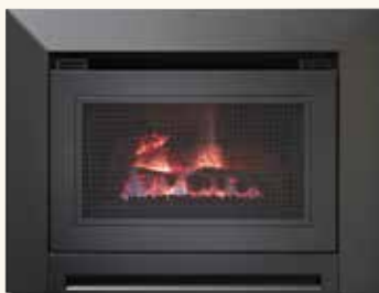
IP28 shown with Contemporary Fascia

Above: IP28 shown with Modular Fascia & optional infill panel