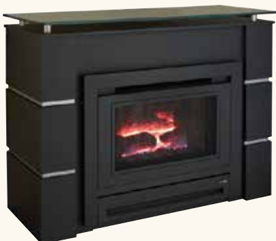
IP28 shown with the Modular Fireplace Solution and slim line fascia