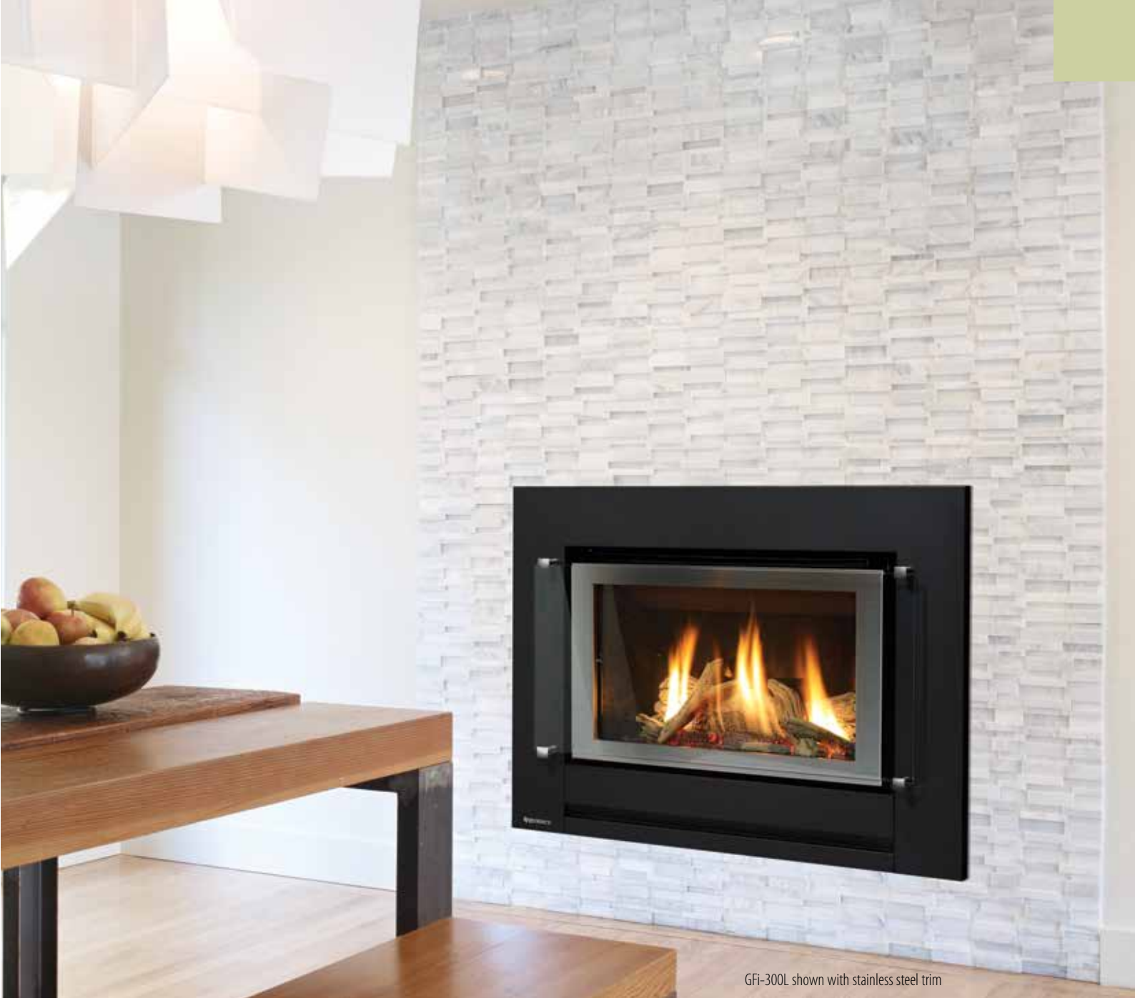
GFI-300L shown with stainless steel trim